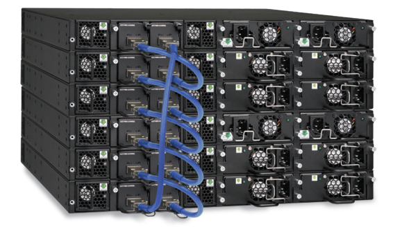
Figure 1: Up to 12 Ruckus ICX 7450 switches can be stacked together using two full-duplex QSFP+ 40 Gbps ports that provide a fully redudant backplane with 960 Gbps of stacking bandwidth.

Deployed as a standalone switch, a stack, or a network fabric, organizations reap the benefits of a flexible platform and the assurance that their investments are protected.