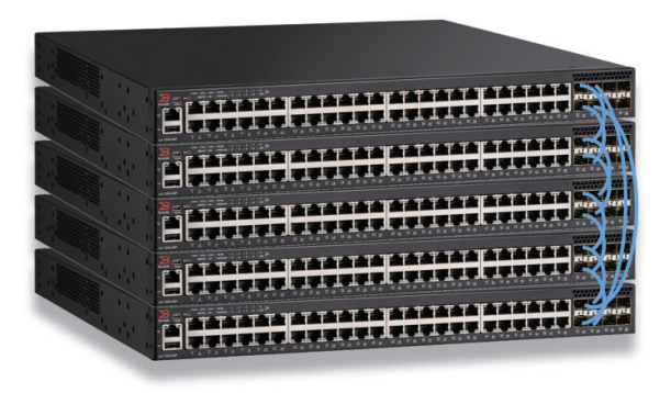
Figure 1: Up to 12 Ruckus ICX 7250 Switches can be stacked together using up to four full-duplex SFP+ 10 Gbps ports for a fully redundant backplane with 480 Gbps of aggregated stacking bandwidth.

Designed for small to medium-size enterprises, branch offices, and distributed campuses, these scalable edge switches deliver enterprise-class functionality at an affordable price—without compromising performance and reliability. The Ruckus ICX 7250 delivers wire-speed, non-blocking performance across all ports to support latency-sensitive applications, such as real-time voice/video streaming and Virtual Desktop Infrastructure (VDI). The switch is available in 24- and 48-port 10/100/1000 Mbps models with 1 GbE uplink or 10 GbE dual-purpose uplink/ stacking ports (see Figure 1)—with or without PoE and PoE+—to support wireless mobility, and IP communications without the need for additional power outlets or power injectors.