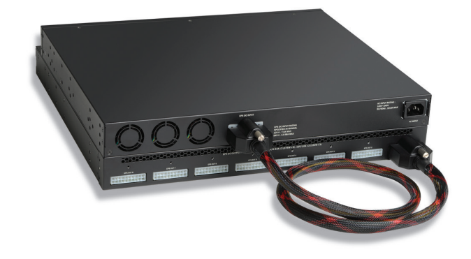
Figure 3: Rear view of the Ruckus ICX-EPS 4000 connectivity.